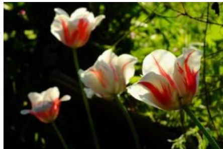
"2015-04-27 Tulip, White and Red Sasayama, Hyogo Japan

Ideally, spring bulbs need to be planted in early November or before the first hard frost in your area. However, bulbs are also very forgiving and may still bloom even when put into the ground as late as early March.